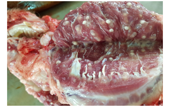
Figure 2.2: Metacestodes after retrieval in phosphate buffered solution

Figure 2.1 Muscle of pig infected with metacestodes